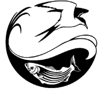
wellsreserve at laudholm