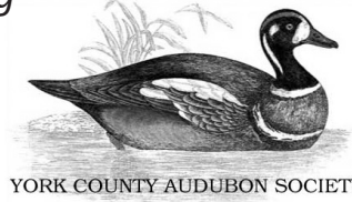
YORK COUNTY AUDUBON SOCIETY

Keep your feathered friends fueled this winter by providing tasty, premium quality bird food while supporting two of your favorite environmental organizations!