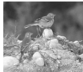
American Pipits

For a place no one seems to think of when they think of birding, there's a lot to see. Plus, it's a gorgeous walk in almost any weather; if you're a Kennebunk resident, you may very well see some of your neighbors; and without a doubt someone will ask you what you're looking at with your binoculars, and you can tell them about all the cool birds to see at Kennebunk Beach.