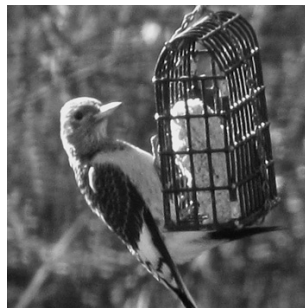
Red-headed Woodpecker

Species counts were well within the usual range and we added three new species. We totaled 85 species for the day plus 2 count week birds (Barred Owl, and Mute Swan). Our new species were Eastern Screech Owl found by Derek Lovitch and Luke Seitz, Red-headed Woodpecker reported by