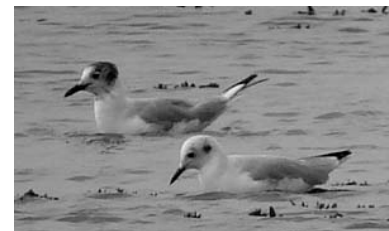
Bonaparte's Gulls

After a weather delay because of the freezing rain on Saturday, we held our Biddeford/Kennebunkport Count (MEBK) on Monday, Jan. 2 with clear skies, warm temps, but strong winds most of the day which was in part most likely responsible for the low land bird count. Was that strong wind partly responsible for the very high count of Bonaparte's Gulls, Kittiwakes, and Razorbills off Eastern Point or were those numbers great only because of a plentiful food supply near the coast? Either way, we blasted a couple previous high counts! Bonaparte's Gulls (previous high 54) this year 306 and Black-legged Kittiwakes (81) 705.