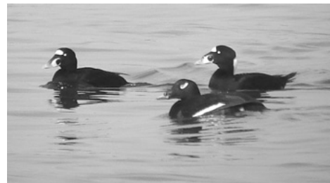
Three Scoters

I'm not an expert birder. Yes, I know a fair number of species, but when faced with a mixed flock of shorebirds or sparrows, they usually become LBJ's for me (little brown jobs). I love looking, though, and I'm fortunate to live about a mile and a half from Kennebunk Beach. Not exactly a hot spot in the birding world, I'll admit, but actually a pretty good place for birds, especially in the fall and winter.