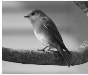
Eastern Bluebird

The high Bluebird count is exciting - is this a result of those folks who have been building and maintaining Bluebird House trails? Are we beginning to see the results of their efforts to help this species? Hopefully, the answer is YES!