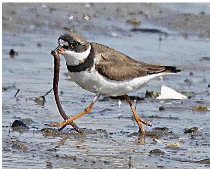
Semi-Palmated Plover in Scarborough with tasty treat