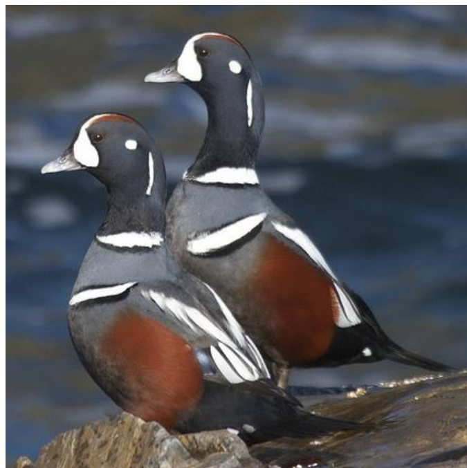
Harlequin Ducks

Located on top of Bald Head just south of Ogunquit, the Cliff House offers sweeping ocean views that make for wonderful sea birding, especially from November through March. Though private property, the owner welcomes birders. Regular winter sightings include Common and Red-throated Loon, Horned and Red-necked Grebe, Common Eider, Long-tailed Duck, Black Guillemot, Red-breasted Merganser, and all three species of Scoter. It is one of the most reliable sites in southern Maine for finding Harlequin Duck, King Eider, and alcids including Razorbill, Thick-billed Murre, and Dovekie. Northern Gannet sometimes approach close to shore and Purple Sandpiper can be seen along the rocks. On rare occasions Pacific Loon may also be encountered here.