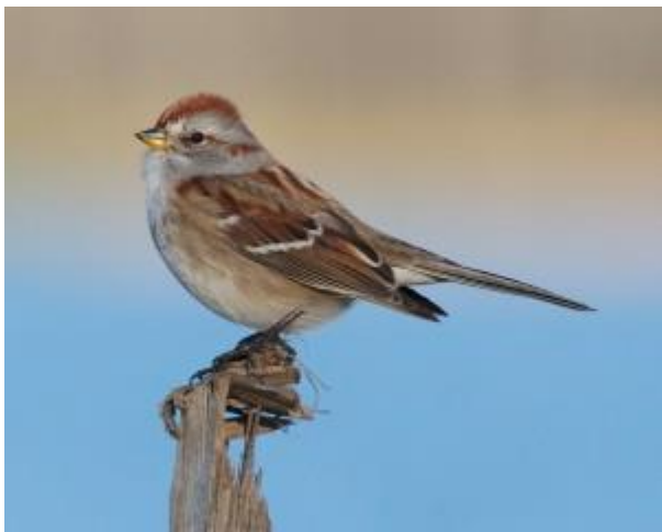
American Tree Sparrow

Want to learn more about the many sparrow species that breed in and migrate through Maine? Want to know the difference between a sparrow and a finch? How can one bird be both a bunting and a sparrow? Why are longspurs no longer sparrows? Often skulking, elusive, and confusingly similar, sparrows can make any birder prefer fall wood-warblers. As part of this workshop, you will learn how to find and observe sparrows in their preferred habitat. We will learn through classroom and field time useful foraging behaviors, flight characteristics, and vocalizations helpful for identification and appreciation of Maine's sparrows. The workshop will feature some of the rare species that have turned up in Maine, and some that might yet so you'll be prepared! The marsh sparrows, Le Conte's versus Grasshopper, who was Henslow, and the tricky Spizella are some of the featured sparrows.