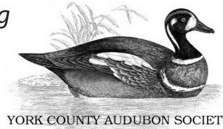
YORK COUNTY AUDUBON SOCIETY

Keep your feathered friends fueled this winter by providing tasty, premium quality bird food while supporting two of your favorite environmental organizations!