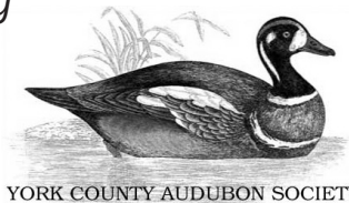
YORK COUNTY AUDUBON SOCIETY

Keep your feathered friends fueled this winter by providing tasty, premium quality bird food while supporting two of your favorite environmental organizations!