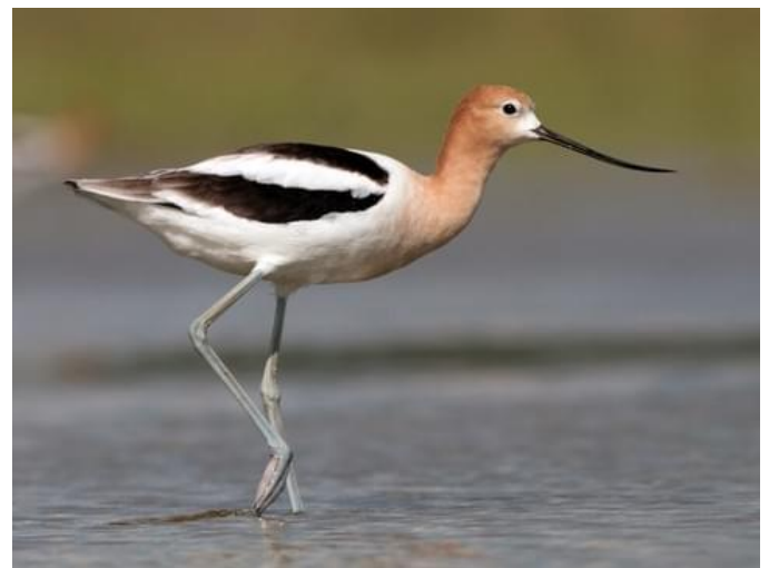
An American Avocet was spotted at Hills Beach in Biddeford on August 21st

We’re now using eBird’s “up to the minute” tracking. You can access that tally via our website at yorkcountyaudubon.org/quest , or directly: https://ebird.org/me/subnational2/US-ME-031?yr=cur