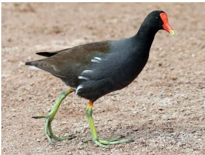
A Common Gallinule was spotted at Fortunes Rocks Beach in Biddeford on October 21st