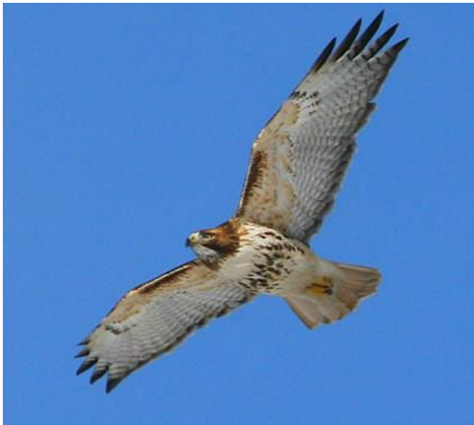
Red-tailed Hawk in flight

This hike was important to me because I was able to take the time to appreciate the surrounding ecosystem, and how just stopping and taking a moment to listen and look around can be important sometimes.