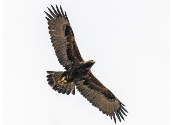
A Golden Eagle flew over S. Berwick on March 6 th

How many bird species can be seen in York County in a single year? We do our best to answer that question each year with our “Quest for 300.” In 2019, we almost got there, with a final tally of 297 species.