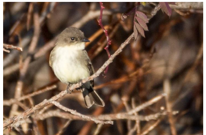
Here's the Eastern Phoebe found in York.