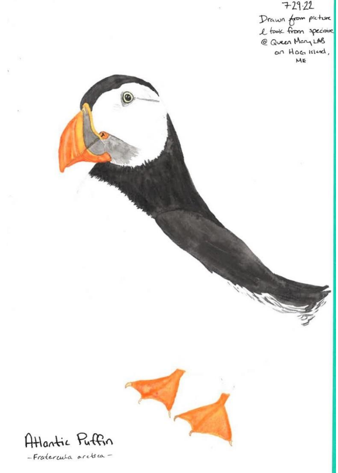
One of Lindsay's nature journal pages

present before heading to the tidepools to explore. Well - just like any good plan, sometimes there are those who listen, and those who are just too excited & can't wait to get their hands dirty and poke around. So imagine those 40 adults being good listeners now scrambling over rocks, slipping and sliding on the seaweed, wading